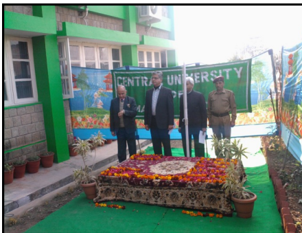
Flag Hoisting Ceremony By Hon'ble Vice-Chancellor