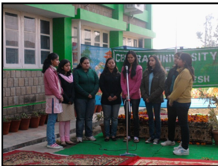
Students singing the National Song

26th January 2011; The Central University of Himachal Pradesh celebrated the Republic day at its camp office, Dharamshala. The event was initiated with the flag hoisting ceremony by the Hon'ble Vice Chancellor; Prof. Furqan Qamar. It was followed by National Song “Vande Mataram”, being sung by all present there with substantial zeal. Afsana's poetics followed suit. It aimed at imbuing in everyone a spirit of patriot-