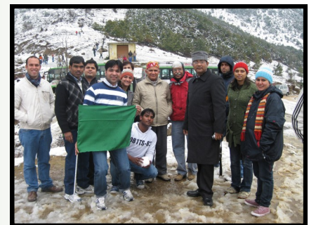
Hon'ble Vice Chancellor accompanied by the students and Faculty members visited the site of CUHP campus on 15th January 2011, to mark the beginning of the first Foundation Day Celebrations