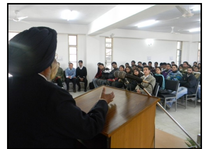
In conversation with the students of CUHP